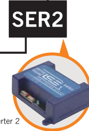
6-81326 Lionel LCS Serial Converter 2 (SER2)