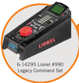
6-14295 Lionel #990 Legacy Command Set

Constant voltage power is output from the 2 Fixed Channels based on the power provided to the Input Channels. These tracks are for command-equipped trains (Proto-Sound 2.0 or 3.0, Lionel TMCC or Legacy).