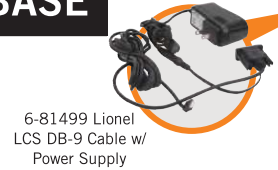
6-81499 Lionel LCS DB-9 Cable w/ Power Supply

Use the App to Run Lionel Legacy Locomotives and Access Legacy Features