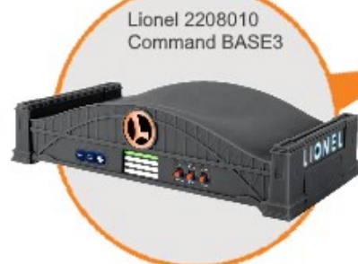
Lionel 2208010 Command Base3

DCS — Simply the Best Way to Run a Railroad