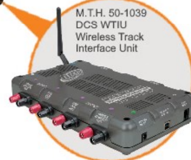
M.T.H. 50-1039 DCS WTIU Wireless Track Interface Unit

Item No. 50-1017 TIU/Barrel Jack Adapter Cable