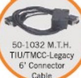
50-1032 M.T.H. TIU/TMCC-Legacy 6' Connector Cable