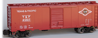
1153 T&P Box car