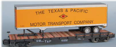
6027TOFC Flat w/ Trailer