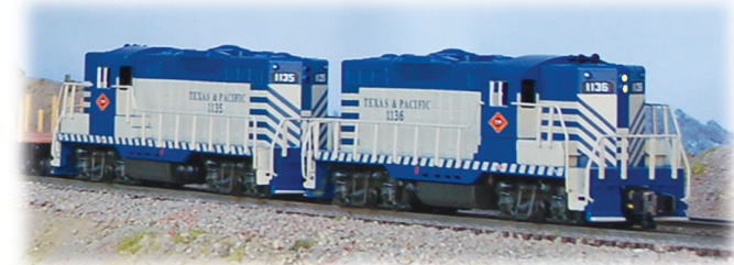
The T&P GP9s 1135 and 1136 are also available in their "as delivered" blue and gray scheme.

The T&P may have been the most popular road produced for S gaugers in the 1950s as the Swamp Holley orange engines were made for 4 years running. We are making these available in our new GP9 DX version with added window glass, painted railings and all parts assembled. Also the T&P freight cars shown below enhance the line up. Shipping in November 2014. (Cars are available in multiple number variations).