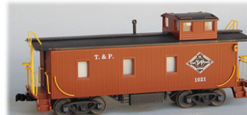
7533 T&P Wood Caboose