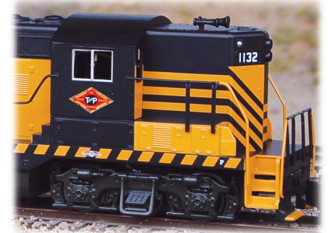
We commissioned a world class firm to superbly decorate these locomotives in the original delivered phase 2 paint schemes. (From EMD in 1957).