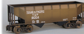
3277 T&P Coal Hopper