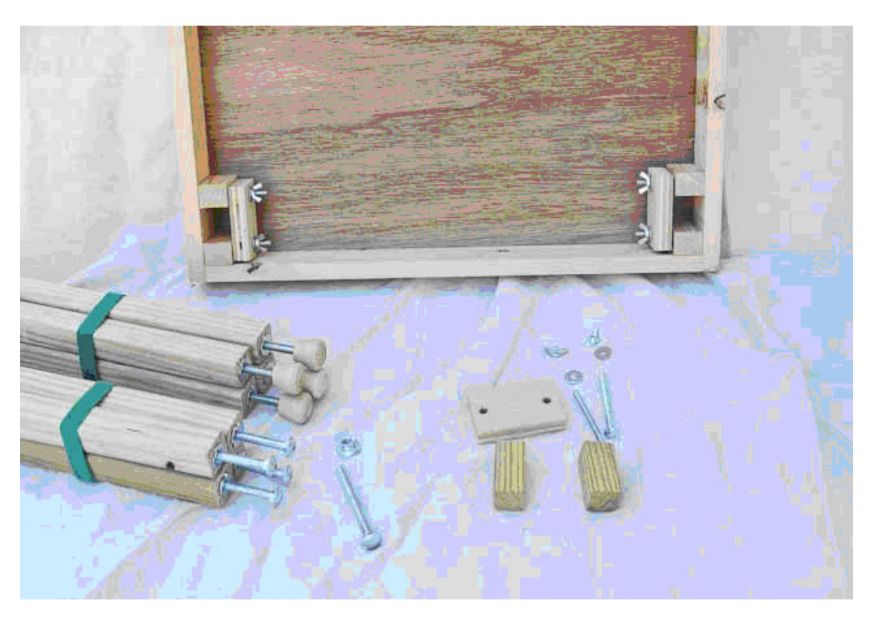
Tip: Always tighten the wing nuts after take down to prevent them being lost.

A retaining plate is attached to a set of blocks using two carriage bolts with a washer and a wing nut to each corner. The set of blocks must be of slightly smaller width than the overall outside width of the leg in order to maintain securing pressure on each leg. The leg should not fall out when assembled.