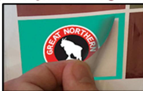
Step 2: Peel off the Chosen Decal