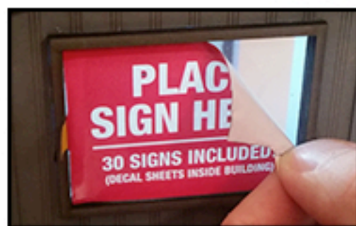
Step 1: Peel off the Placeholder Decal