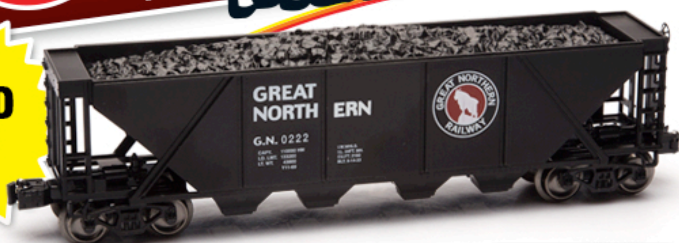
Great Northern Hopper 279-3045