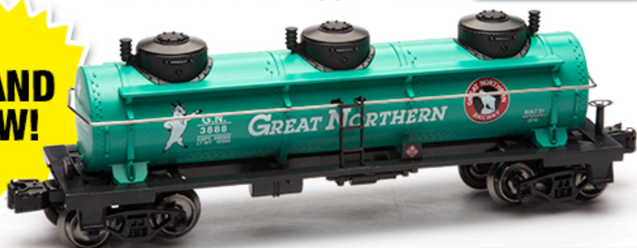
Great Northern Tank Car 279-2680