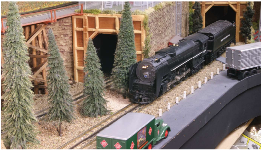
Steam power and the Railway Express Agency's green trucks were once common sights in many areas.