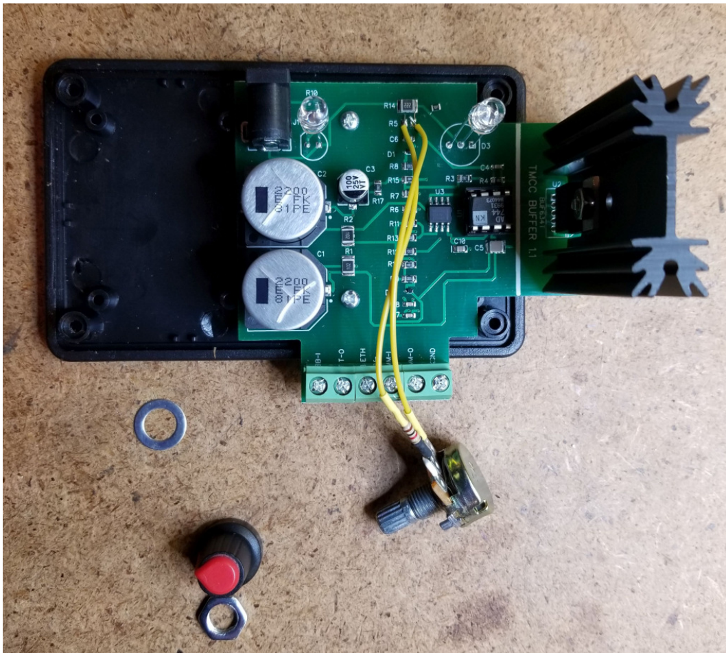
Figure 2: Gain Adjustment Connections to Main Board