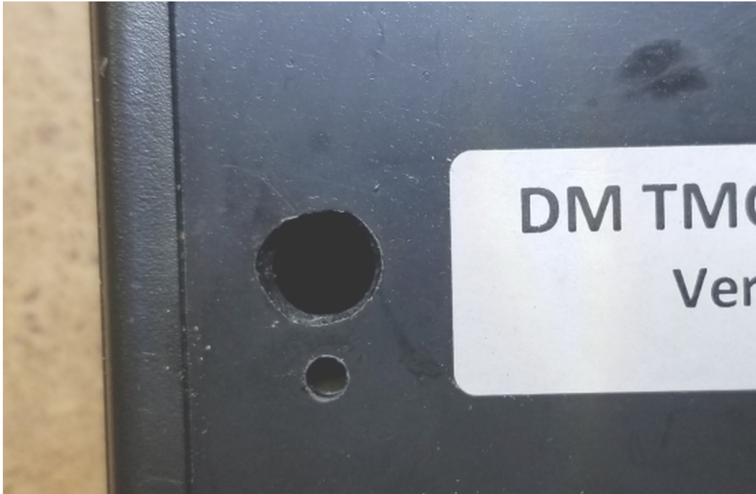
Figure 3: Pot Mount Drilling Detail