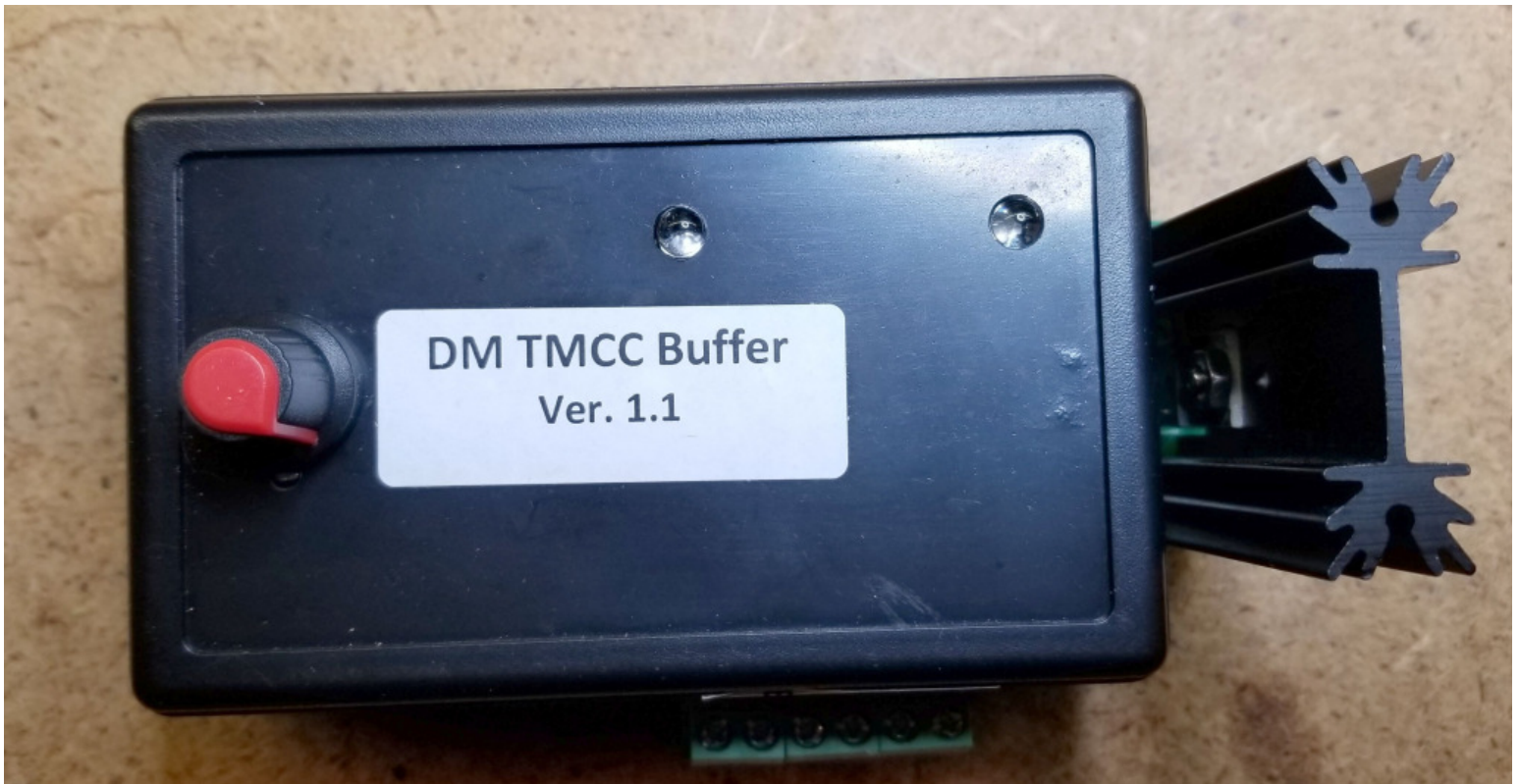
Figure 4: Buffer With Completed Gain Mod Installed