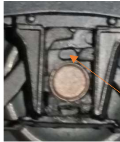
Broken journal back tab snapped off at base