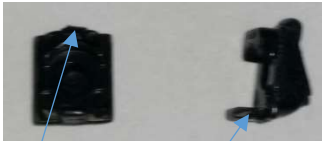
slot tab Good journal cover (back and side view)