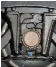
Glue here sparingly and ONLY if desired. Not required / recommended.