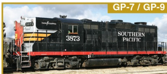
GP-7 / GP-9