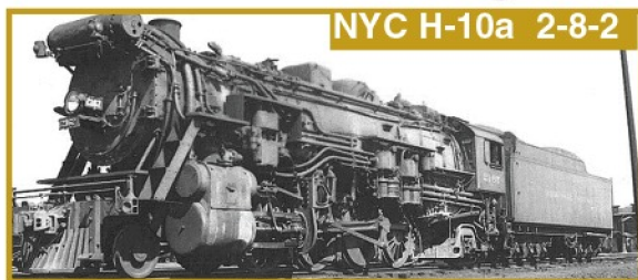
NYC H-10a 2-8-2