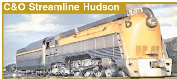
C&O Streamline Hudson